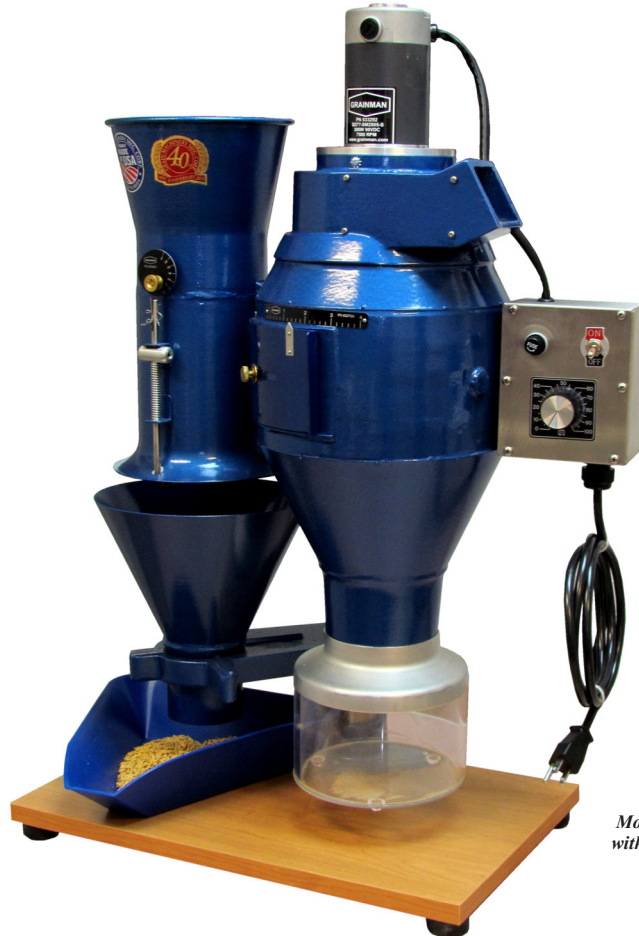
Model 63-115-60VS Laboratory Aspirator shown with Variable Fan Speed Control

The Grainman Grain Cleaner Laboratory Aspirator Equipment No. 63 is designed for grains and seeds analyst, inspectors and laboratory users who require quick yet thorough separation of granular materials from foreign matter. It can be carried anywhere, requiring small space and may be plugged into any convenient electrical outlet.