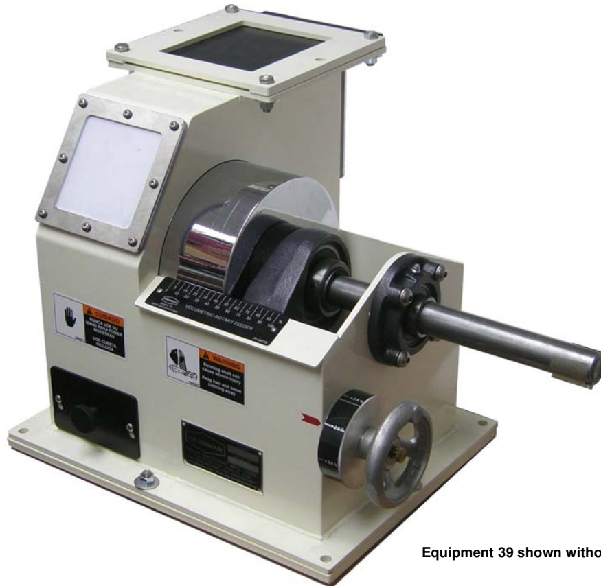
Equipment 39 shown without drive & guard

In almost every rice mill, after milling and polishing the rice, the mixture is graded and the separation of the head or whole grains from the different sized brokens takes place.