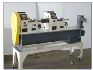
Blender System with two Equipment No. 39 Rotary Feeders are shown for illustration purposes – Consult us for pricing and system options

* Capacities are based on free flowing dry grain weighing 48 Pounds per Cu.Ft. being discharged under favorable conditions with a uniform and continuous in-feed. Capacity will vary with other materials.